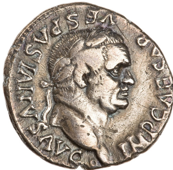
Specimen photograph of a silver denarius of the Emperor Vespasian.

Given the proximity of Chaddesden to all this early activity, it might be thought surprising that no significant Roman remains appear to have been unearthed here in recent times, particularly bearing in mind all the construction work involved in building so many thousands of houses in the twentieth century. Archaeological remains, however, are often buried a considerable depth below present