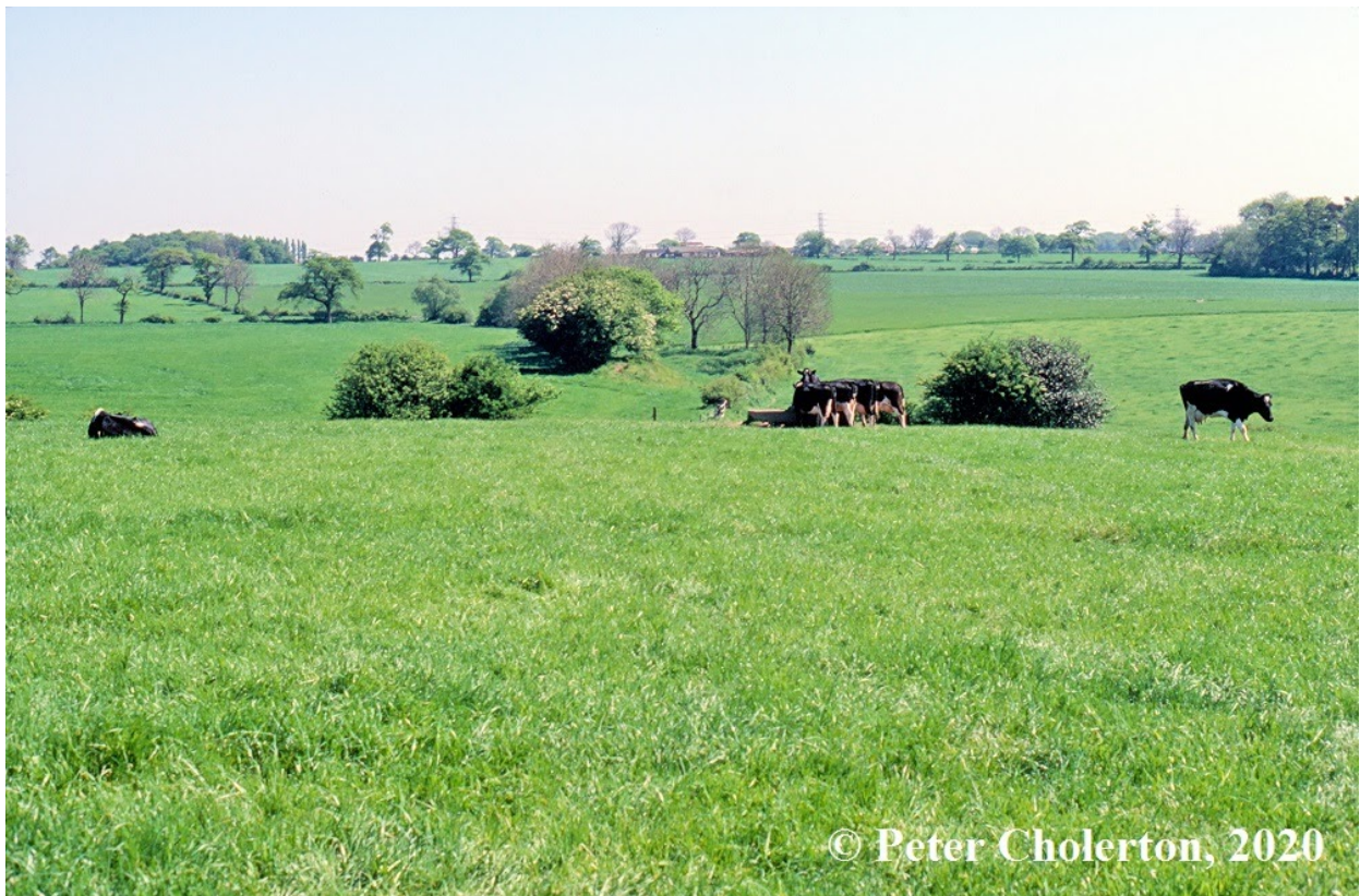
Taken from Footpath 12 and looking northwards, this photograph of c.1978 shows a very rural Chaddesden Common very different to the Oakwood estate of today!

but the dog invariably found a place to squeeze through and a few minutes later the panoramic view over the green fields of Chaddesden Common made the effort worthwhile as may be seen in the next photograph.