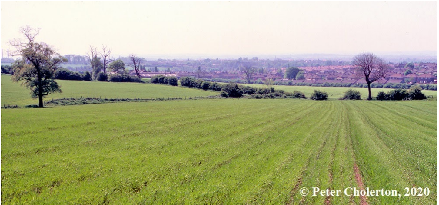
View from Footpath 16 looking southwards over Chaddesden photographed in 1978