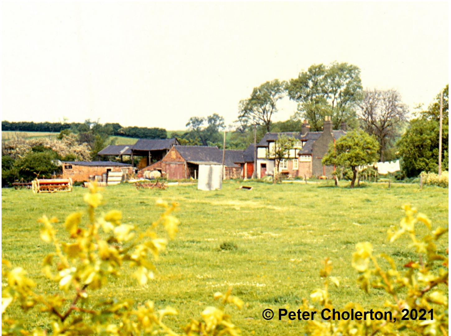
Valley Farm, Morley Road, photographed c.1974. Footpath 12 descended the sloping field visible in the distance over on the left-hand side of the picture.

The path now gradually descended until we reached the land belonging to Valley Farm, where farmer Jack Clarke had helpfully placed a large white-tipped post so that walkers could easily follow the correct line of the footpath. About 100 yards to the southwest of the farmhouse the footpath crossed a small footbridge over an unnamed brook and my dog, Jason, would sometimes exchange a fusillade of barks with Sally, the Clarkes' dog, though this was perhaps to be expected since the two dogs were mother and son! From there it was only a minute's walk to a stile in the hedge and we were on Morley Road and on our way home.