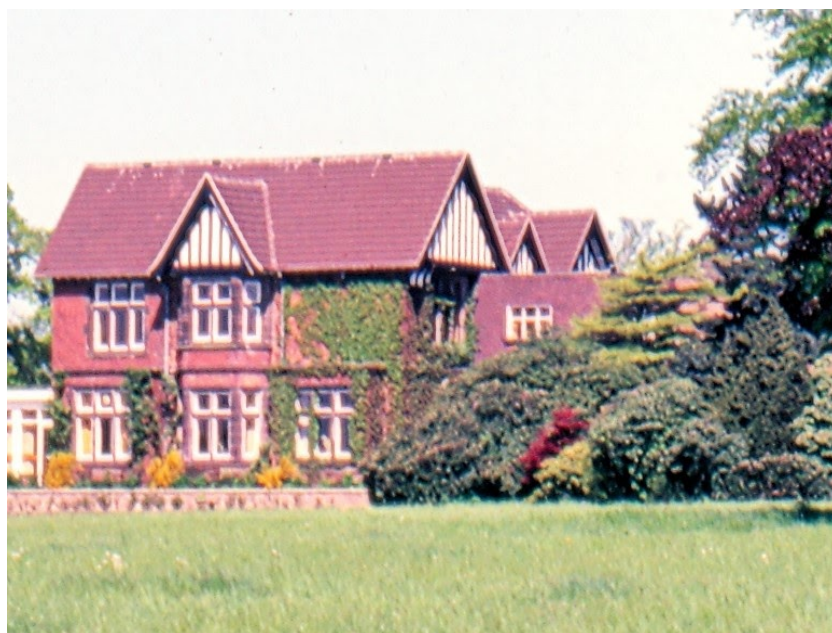
Priory Flatte, Breadsall in 1978.

After walking up a slight gradient for about 400 yards we reached a small spinney with a pond where I often paused for a while to look back towards the houses of Wood Road and Matlock Road (see picture on the next page). 4 The path then continued on its way for another quarter of a mile or so over two further fields, all the time making towards Priory Flatte – the big house in the distance located just off Porter’s Lane, Breadsall. When I took this photograph of it in 1978 it had been renamed Millis House and was used as the water industry’s training centre. It was demolished a few years later and the houses of Priory Gardens, Oakwood, now occupy its site.