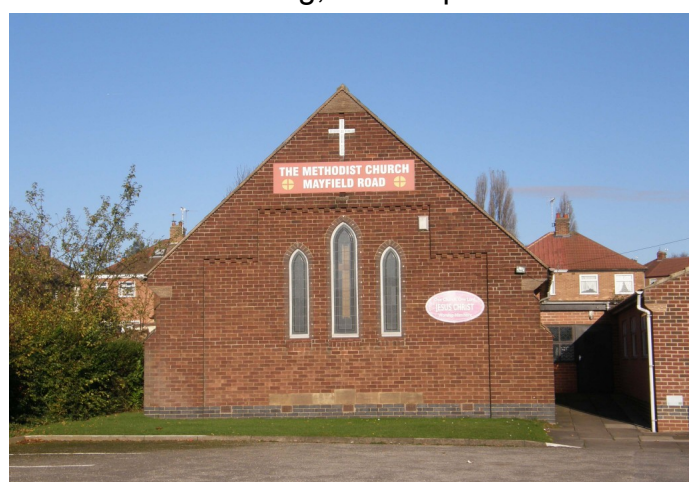
The church in 2010. The houses behind are on Northwood Avenue.

In 1938 it was decided to try to clear the remainder of the money owing, and on the 12th anniversary of the opening of the church, all debts had been cleared and a Thanksgiving Service was held. In 1940 an Extension and Improvement Fund was formed to make improvements to the building. By 1958 a small entrance hall was added along with a vestry, toilets and a kitchen. In 1965 a wooden extension was built by members of the church and was used for a Sunday School. The money was raised for the building, which opened on 19 June 1965 at 4pm. A Young Wives group was formed in